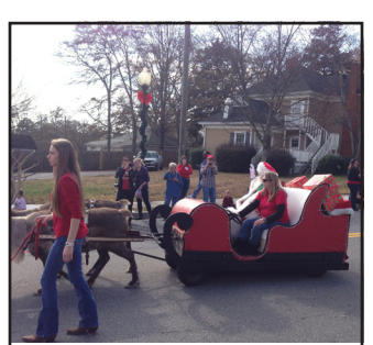
Santa visiting the downtown Kennesaw Christmas Parade!

The mission of the KDDA is to create a vibrant downtown with the assistance of the downtown community, in order to unite and establish viable businesses while maintaining our sense of community and historic heritage.